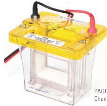
PAGEr™ Minigel Chamber (Code 59905)